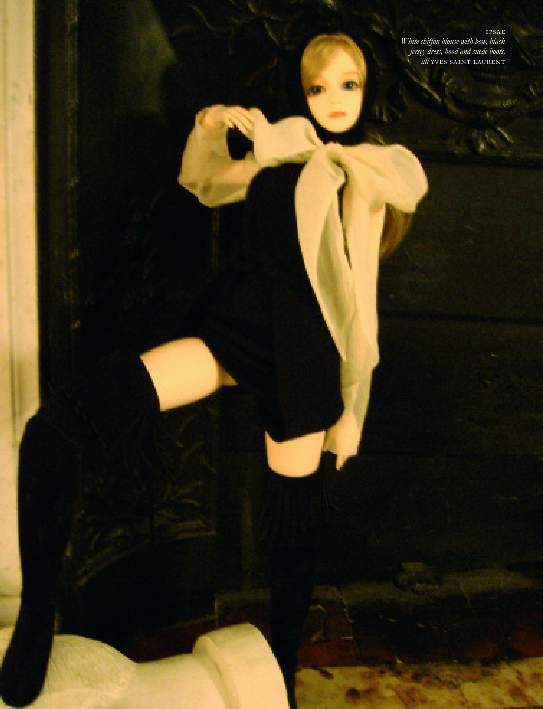
IPSAE White chiffon blouse with bow, black jersey dress, hood and suede boots, all YVES SAINT LAURENT