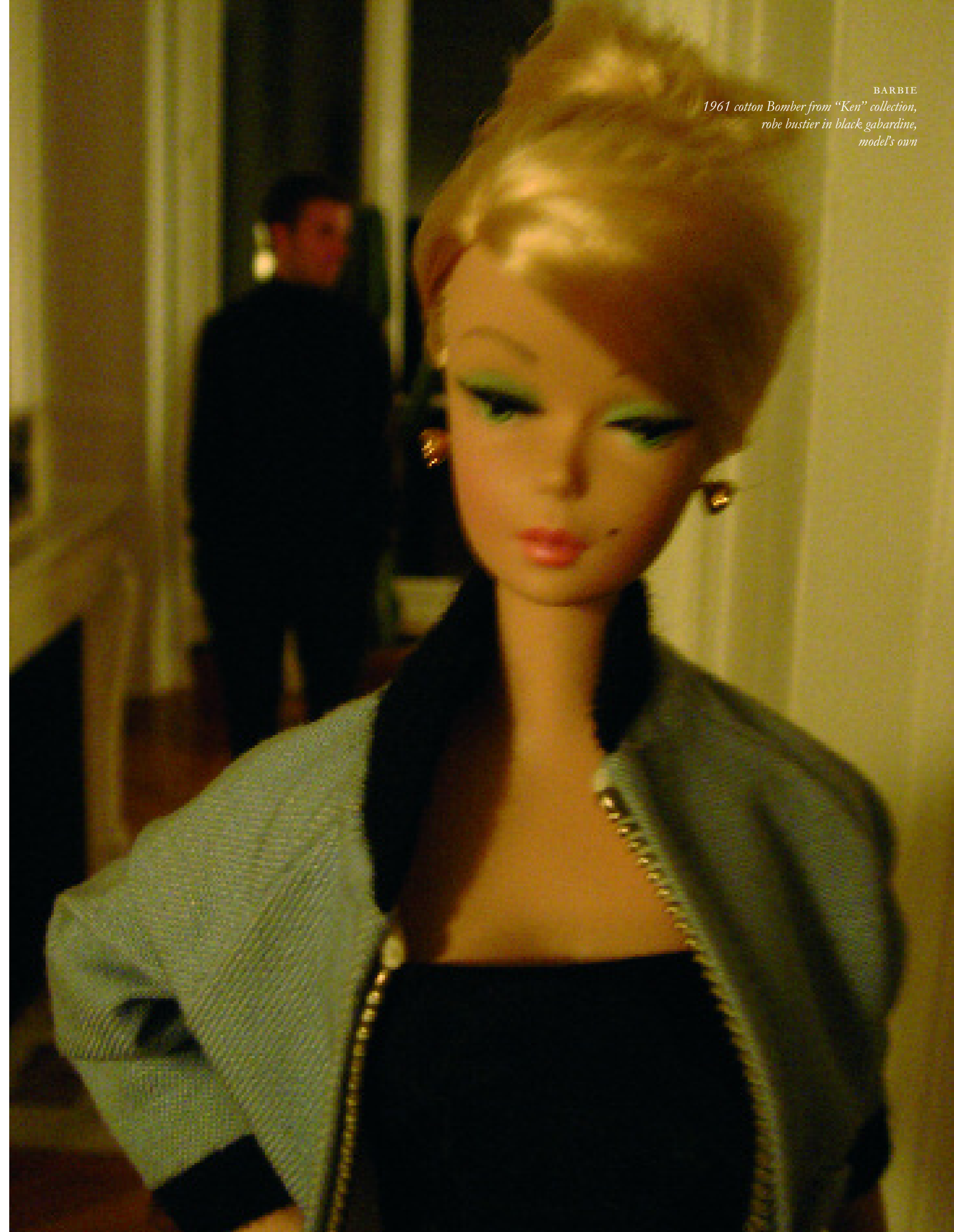
BARBIE 1961 cotton Bomber from "Ken" collection, robe bustier in black gabardine, model's own