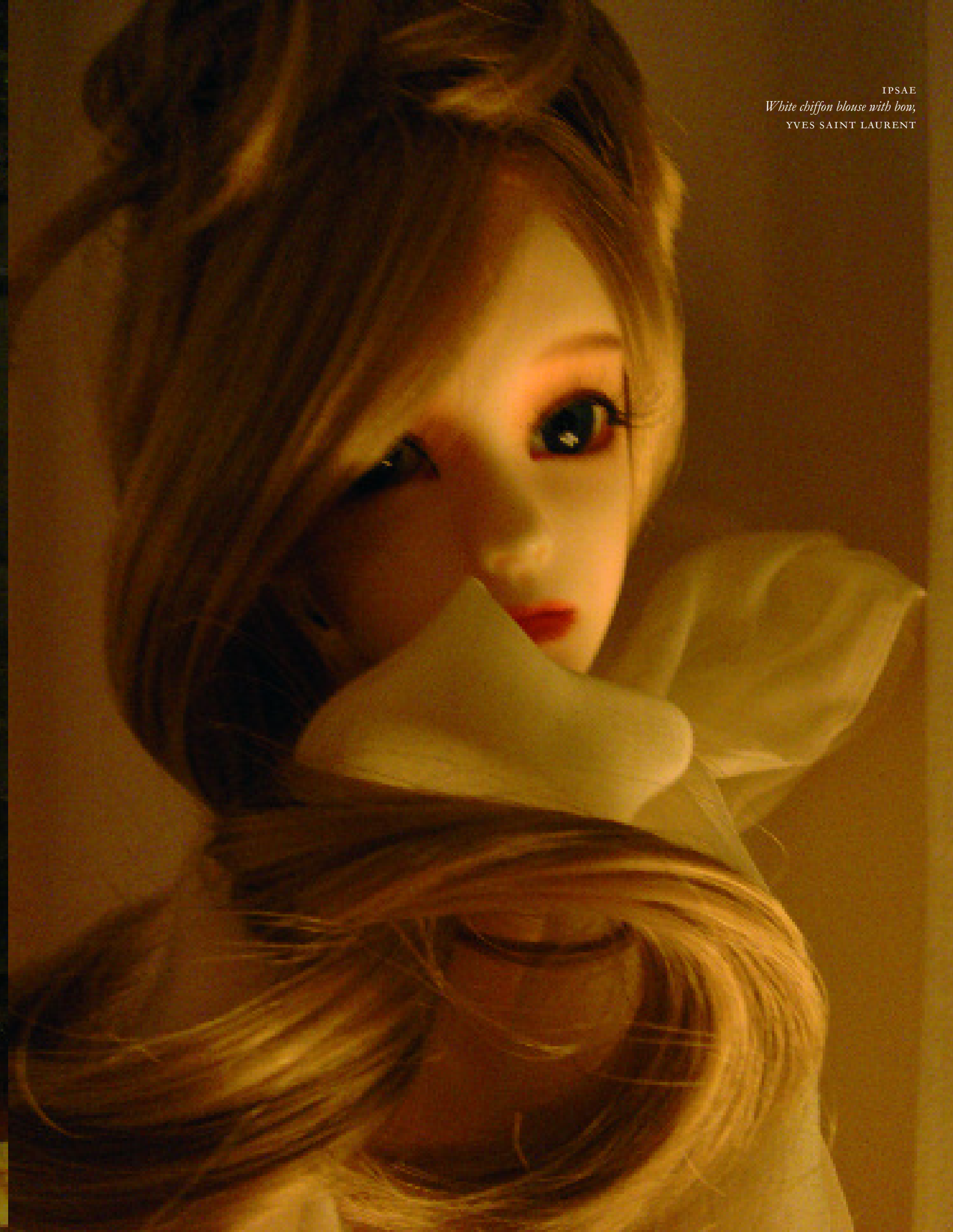
IPSAE White chiffon blouse with bow, YVES SAINT LAURENT